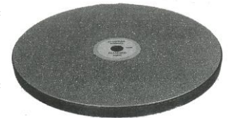
DIAMOND GRINDING DISC with BACKING PLATE

DIAMOND GRINDING DISCS are precision diamond discs bonded to a plastic backing plate. These discs offer a flat parallel grinding surface face for faceting, inlay, general lapidary and glass grinding applications. Also great for carbide and high speed steel tool grinding and shaping. Discs come with a 1/2" arbor hole.