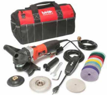
The MK-1503 Wet Diamond Grinder/Sander/Polisher Kit