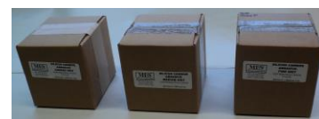
5 Pound Silicon Carbide Containers